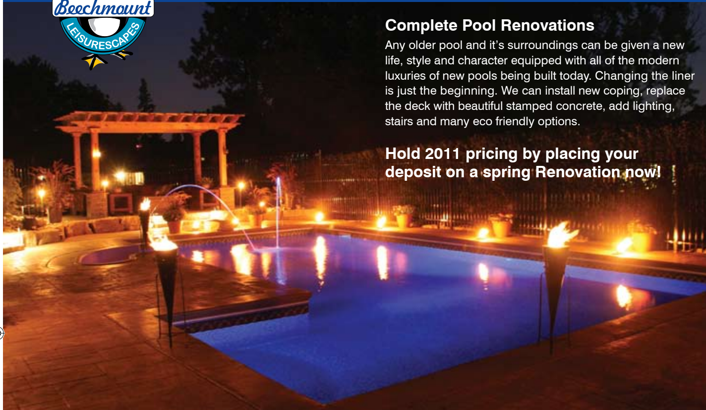
K-W Record's Readers' Choice Gold Award Winner (Swimming Pool Service)

Hold 2011 pricing by placing your deposit on a spring Renovation now!